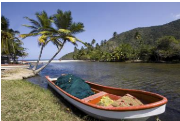
Set Your Goals

Many people now use Group Tele-conferencing with computer viewing as the best way to work across the country and a fun way to work together in groups which is more cost effective for you and less time consuming than physically attending seminars or workshops.