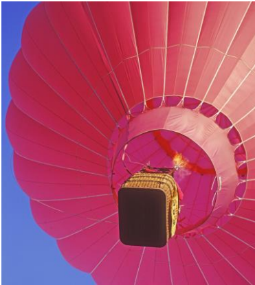
Life Your Life!