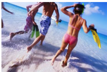
Enjoy Your Friends

Well, there you have it -- some of the things to expect during and after this programme. The best way to enjoy these changes is to get that you are putting yourself first in this programme and that this will both ripple and ricochet.